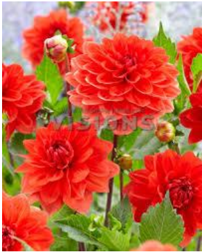
Faith - orangey-red single, really strong stems - an excellent cutting dahlia