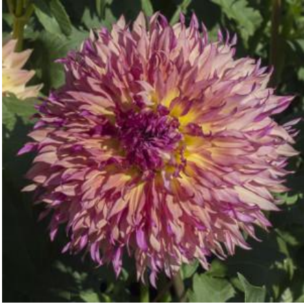
Myrtel's Folly - crazy looking and exotic