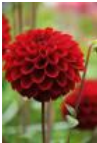
Viking - small ball dahlia - red