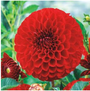
Cornel Red - red ball - nicest red we know - very strong stems for cutting