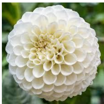
Petra's Wedding - smaller ball dahlia - white – nice for cutting