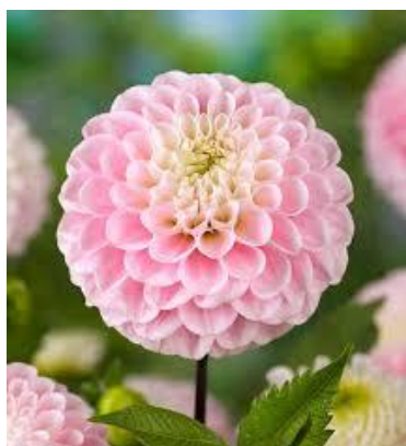
Wizard of Oz - large ball dahlia in pink shades

Surplus dahlia varieties for 'dig your own' - October 20