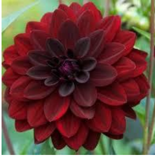
Arabian Night - mid size burgundy – a nice dahlia - we only have a few