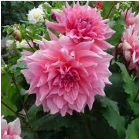
GIANT pink dinnerplate dahlias – a show stopper