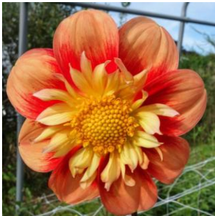
FGL Samuel - but we call her “Ready to Party” - really fun single dahlia